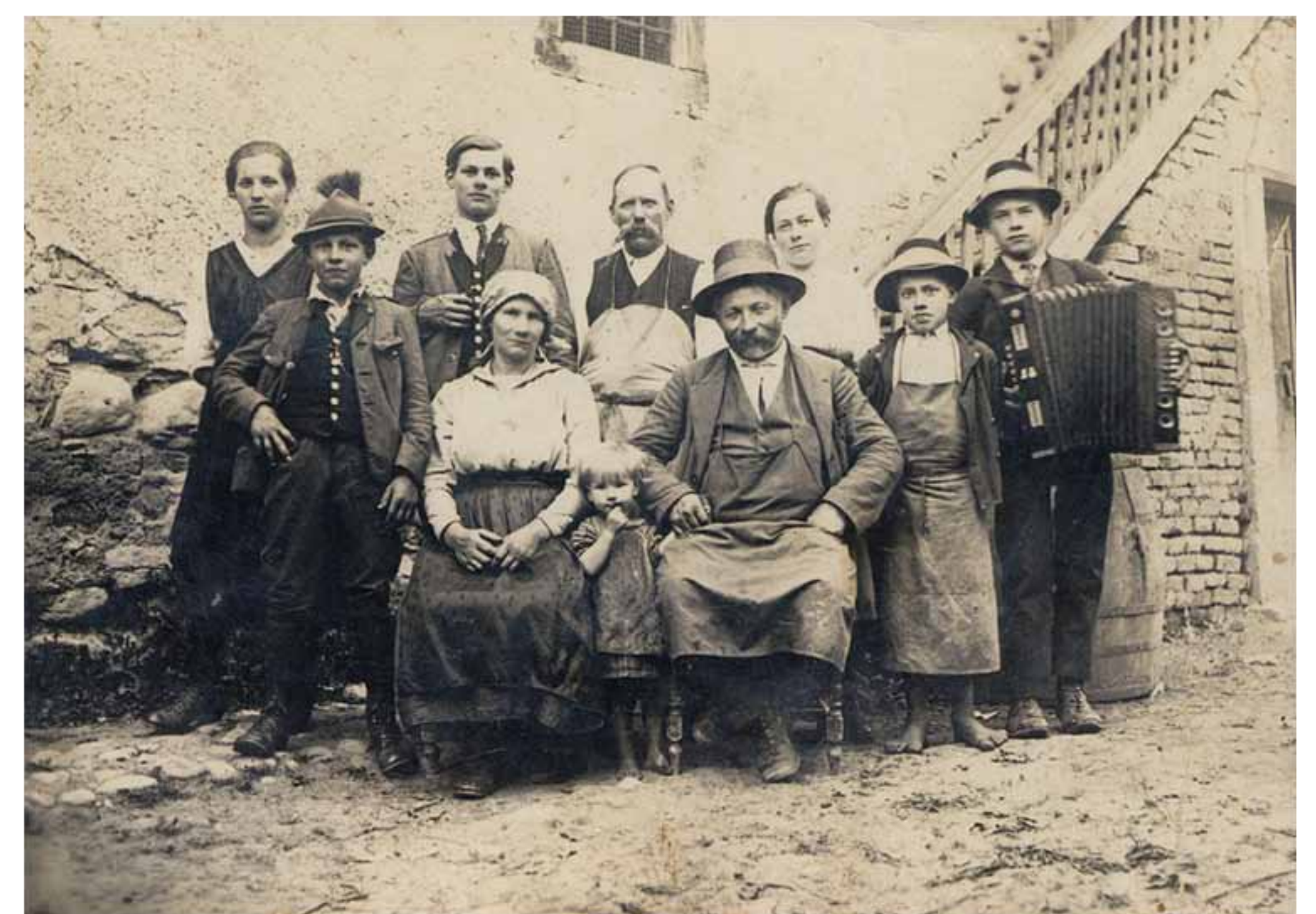
Different heredity laws played a very important role in the development of the lots on each river bank. On the left bank (Hungarian laws) the whole property was traditionally divided among all the children (if there were 5 children, each got one fifth). On the other bank, the right bank (Austrian law) the oldest son traditionally inherited all the property.